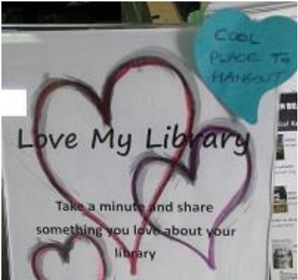
Library love at the Parrsboro Library